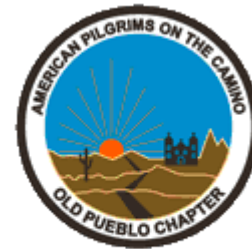
Old Pueblo logo