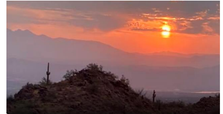
American Pilgrims on the Camino - Valley of the Sun Chapter

https://americanpilgrims.org/iwpmap_directory/valley-of-the-sun/