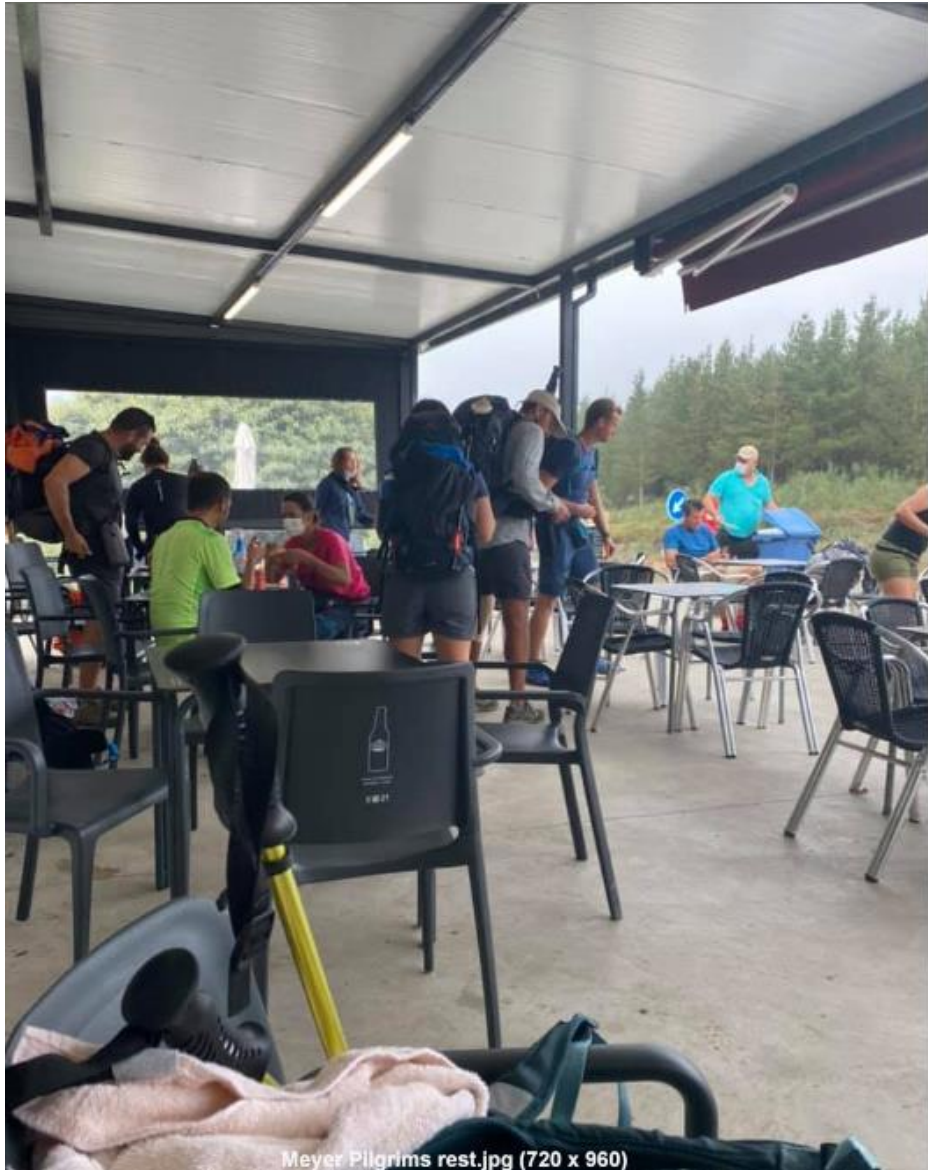
Meyer Pilgrims rest.jpg (720 x 960)